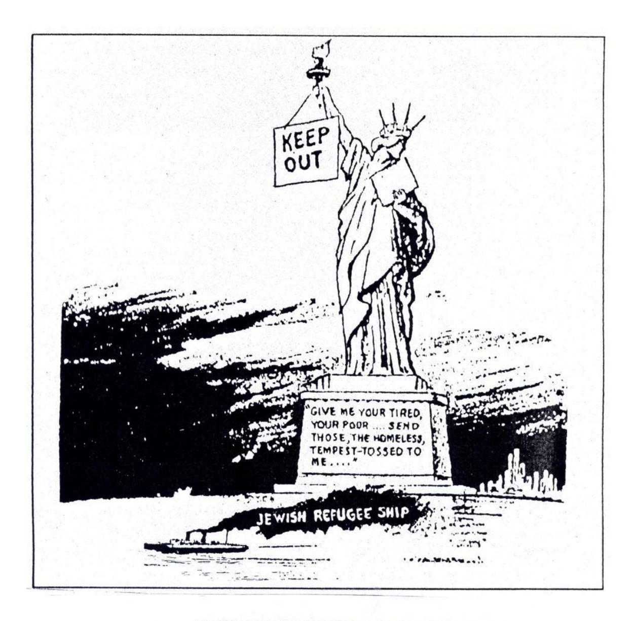
Fred Packer in the New York Daily Mirror - June 6, 1939

Source: Prince, Cathryn J. "No Joking Matter: 1940s Political Cartoons Warned US of Holocaust." The Times of Israel , The Times of Israel, 5 May 2016, https://www.timesofisrael.com/no-joking-matter-1940s-political-cartoons-warned-us-of-holocaust/.