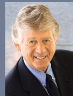
Presented by Central Houston Cadillac