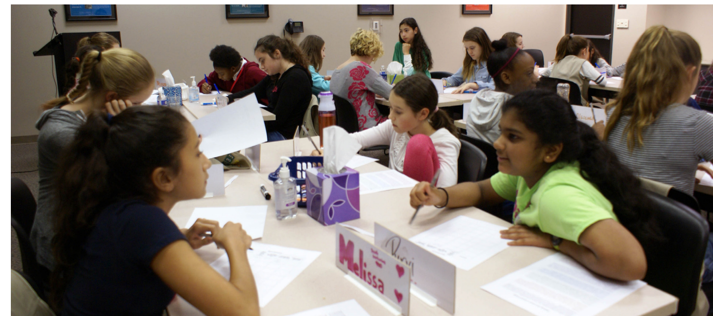
On March 6, 28 Cadette Girl Scouts between the ages of 11 and 13 gathered at the Museum to learn how to be Upstanders. Representing 14 troops across the San Jacinto Council area, the girls joined Museum staff and docents to learn about Holocaust history as well as understand the dangers of hatred, prejudice and apathy in their own lives.