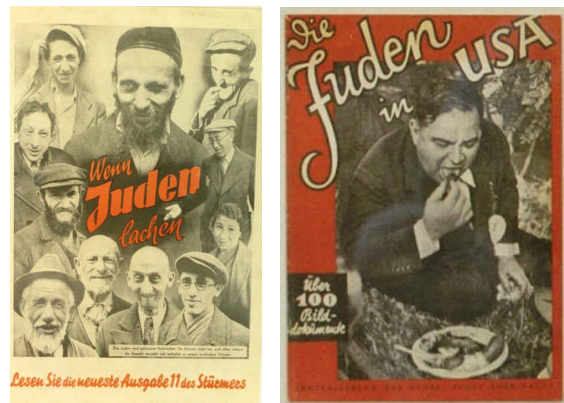
{Artifact 9, 10, 11}

There were two primary types of portrayal of the Jews that were oddly at contrast, but aimed at achieving the same objective. Jews were either portrayed as seedy, degenerate, ugly, masses associated with vermin, or they were portrayed as greedy, fat, and unpleasant elements who sided with the enemy.