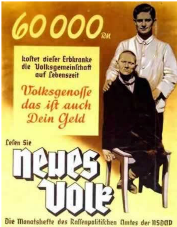
{ Artifact 36 }

The war-crimes trial judgment against Otto Dietrich, the Reich Press Chief, stated that he was responsible for helping "blunt the sensibilities" of the German people to the atrocities committed. To this end, one of the earliest Nazi propaganda posters shows the cost of healthcare for the sick and the disabled. Given the tumultuous economic times, this was used as an excuse to begin "mercy-killing" such people in the interest of the greater good. The posters below (Artifacts 36, 37) show clear examples of posters designed to elicit Hyperbolic Discounting , encouraging people to have a stronger preference for more immediate payoffs relative to later payoffs.