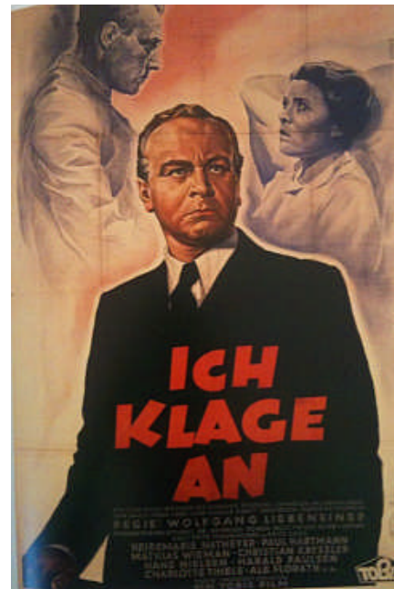
{ Artifact 38 }

While this paper does not focus on any visual media, it is worthwhile to note the role played by movies such as "Ich Klage An" – "I Accuse You" – in desensitizing the population to killing the weak, and the suffering.