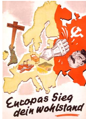
{ Artifacts 40, 41 }

Another common theme was that of patriotism and service, which also helped accentuate the Self-Serving Bias by using the Superiority Bias for Germany victory (Artifacts 42-45). Going back to the Bandwagon Effect , as more and more people joined the German military, it had a reinforcing mechanism of furthering this cause.