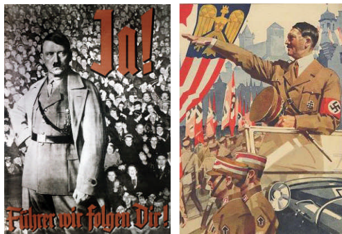
{Artifacts 7, 8}

In addition to these biases, several posters also sought to trigger another bias, namely Bandwagon Effect , where people tend to do or believe things that many other people do, as well. In showing Hitler as an authoritarian leader with the German people behind him, the following posters sought to trigger both Authority Bias and Bandwagon Effect , as evidenced in the posters below: