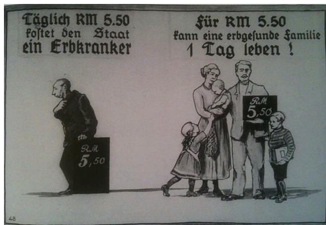
{ Artifact 37 }

While this paper does not focus on any visual media, it is worthwhile to note the role played by movies such as "Ich Klage An" – "I Accuse You" – in desensitizing the population to killing the weak, and the suffering.