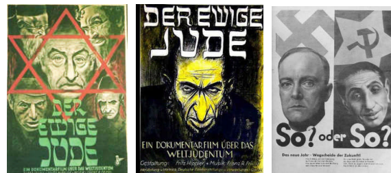
{Artifacts 17, 18, 19}

When the Nazi party came out with the anti-semitic propaganda film that posed as a documentary, The Eternal Jew , they also began using Jewish elements – such as the Star of David and fonts that resembled Hebrew (Artifact 17) – to portray the Jews as a single, culturally distinct population separate from the Germans. This practice can be seen elsewhere, as well, and continued to be used to distinguish the Jewish cultural identity as being separate from the German national identity, as seen in Artifacts 17, 18, 19.