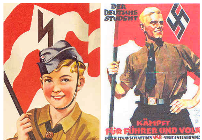
{ Clockwise from top left: Artifacts 32, 33, 34, 35 }