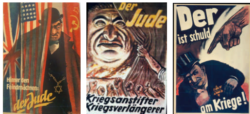
{Artifact 13 - A Consolidated Theme}