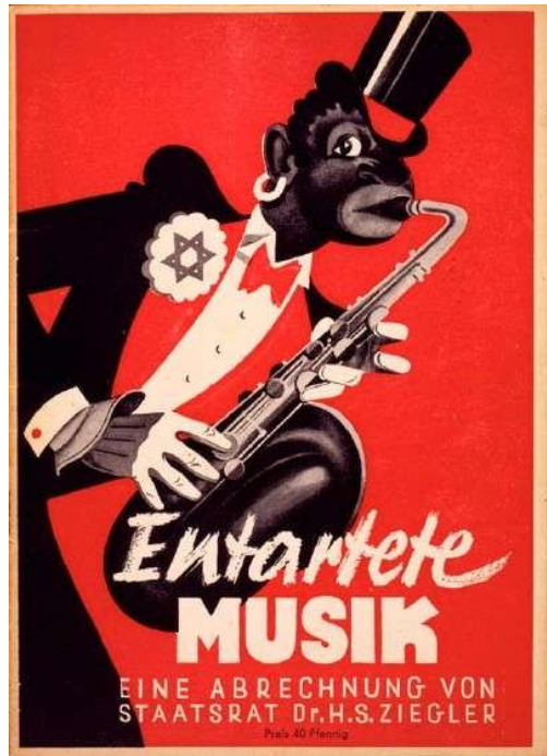
{ Artifacts 28 }

It was also used to discourage popular phenomenon of the time, such as Jazz music (Artifact 28). In addition to the clear racial overtones associated with Jazz, the player is also wearing a Star of David, while the poster reads " Degenerate Music ", in reference to how anything associated with Jews was considered degenerate by the Nazis.