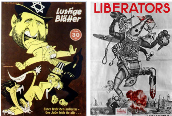
{ Artifacts 24, 25 }

Such portrayal was also used in both German-occupied countries as well as countries that were at war with Germany (Artifact 26) to show the Jews as being responsible for World War II (Artifact 27).