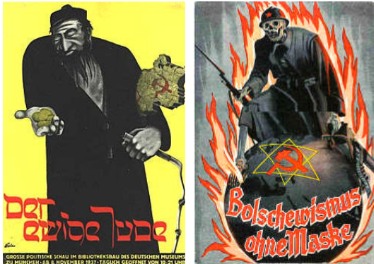
{ Artifacts 20, 21 }

We had previously discussed how the Nazis used association quite frequently. This is particularly evident when it came to portraying other enemies of the German state in an unpleasant light. As seen in Artifacts 20, 21 below, the Nazis combined the portrayal of the Bolsheviks and the Jews in a single image, creating an impression that the Jews were responsible for communism.