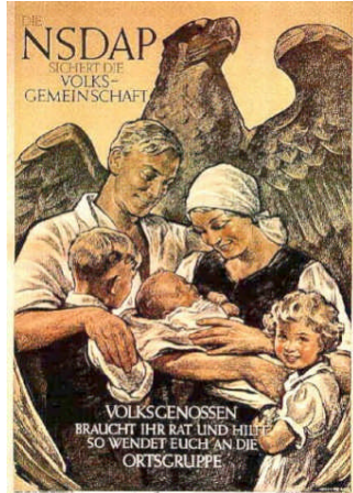
{ Artifacts 29, 30 }

The primary objective of such a portrayal was to show the hardworking German family, which was being unfairly punished by the cost of reparations from World War I. In doing so, the Nazis succeeded in propagating what is now known as Ingroup Bias , which is the tendency for people to give preferential treatment to other people that they perceive as being members of their own group. This, in combination with the anti-Jewish propaganda, succeeded in distancing the majority of the German population from the rest of the undesirables.