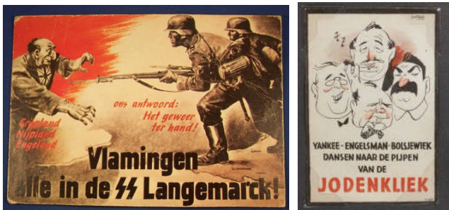
{ Artifacts 22, 23 }

Even when other enemies, such as the United States of America or England were depicted, it is hard to miss the caricature of a Jewish-like person being portrayed as being responsible (Artifacts 22, 23), or the presence of Jewish cultural elements such as the Star of David (Artifacts 24, 25). This was used to elicit a decision-making bias stemming from Framing , where how something is presented affects the perception and rationale of a decision.