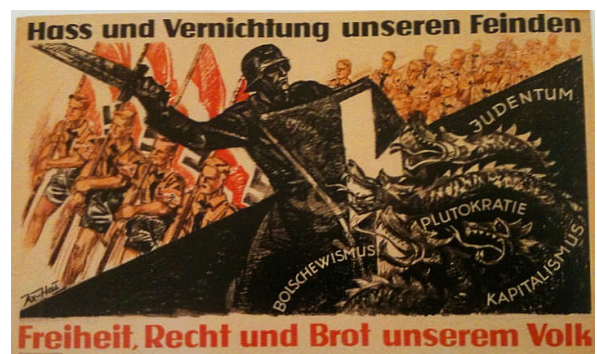
{ Artifact 39 }

To this end, once again the Nazis used the familiar theme of "Us vs. Them" to elicit a Self-Serving Bias citing Lebensraum , or living space, as the reason. [7] In the poster below, we can see this theme played out in the poster which reads, "Hate and Destruction for Our Enemies. Freedom, Justice, and Bread for Our Nation."