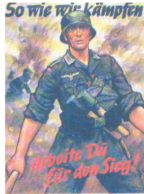
{ Clockwise from top left: Artifacts 42, 43, 44, 45 }

Therefore, in our analysis of the role of Nazi propaganda in rallying the masses, we find that they aimed at eliciting the following key biases – Ingroup Bias , Projection Bias , Hyperbolic Discounting , Self-Serving Bias , and Bandwagon Effect / Herd Instinct – all aimed at creating a genocidal, aggressor state.