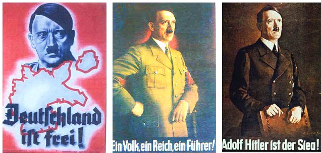
{Artifacts 2, 3, 4}

people aim to trigger the Authority Bias , wherein there is a favorable response to authority on ambiguous stimulus. These exact biases are also sought in the following posters, with similar characteristics: