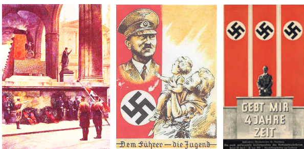
{Artifact 5, 6, 7}

While the poster below in Artifact 5 does not necessarily contain a halo, the viewer's attention is first directed at the god-like patriarchal figure on top, and then one discovers a figure resembling Hitler on the bottom left. This triggers an association stimulus, where Hitler is associated with the god-like figure that first catches the user's attention, resulting in a Halo Bias trigger through association . The same is effect is achieved in the other two Artifacts 6 and 7, as well.