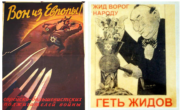
{ Artifacts 26, 27 }

Such portrayal was also used in both German-occupied countries as well as countries that were at war with Germany (Artifact 26) to show the Jews as being responsible for World War II (Artifact 27).