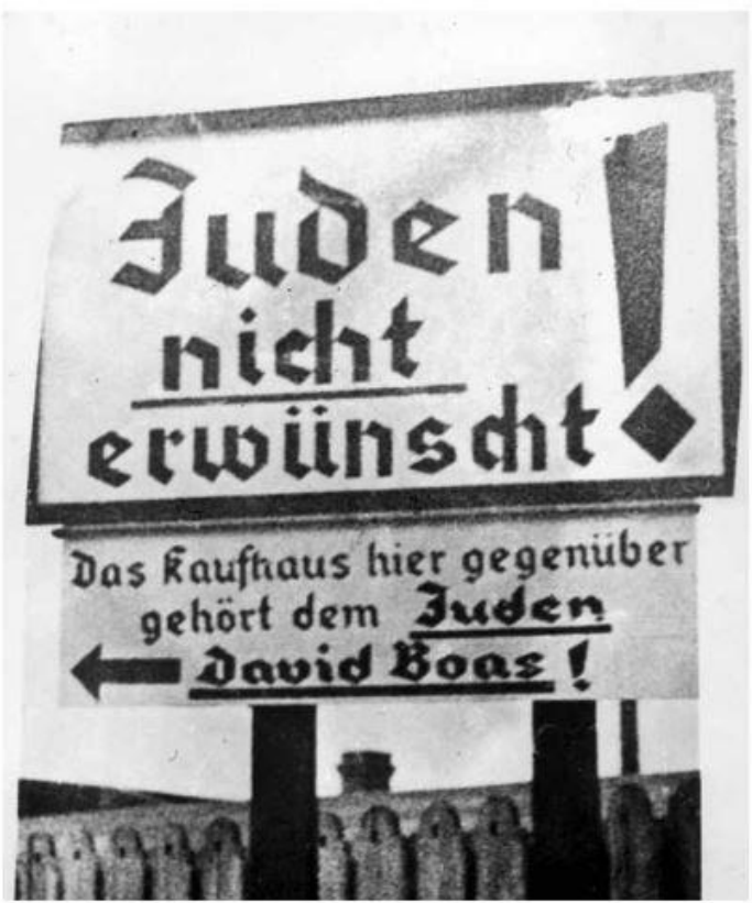
Figure 2: The Nazis in Power

^ The sign from Bad-Harzburg in Germany says: “Jews are not desired! The shop on the opposite side belongs to the Jew David Boas! ”